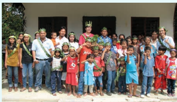
Figure 5: A group photo with the villagers

presenting packages that contained rice, cooking oil, sugar and canned food to the families at the settlement.