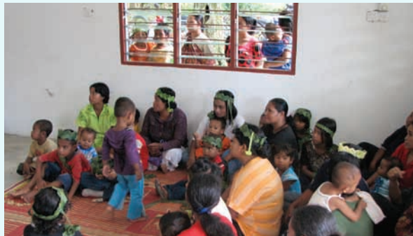
Figure 3: Villagers present at the event